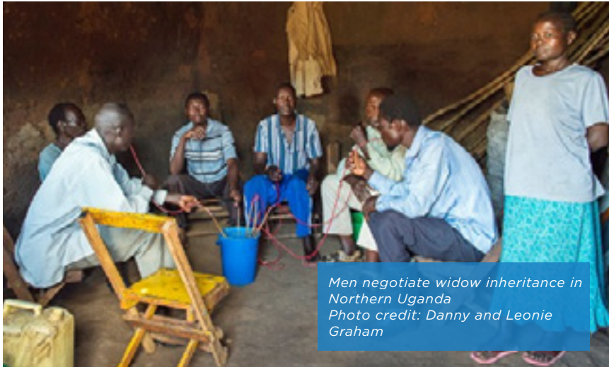
Men negotiate widow inheritance in Northern Uganda

You have the right to start a family by marrying whomever you choose and determining when you are ready to get married and start a family.